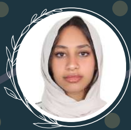
LIGAA NIZAR ELDIRDIRI KHALIFA 4 a^