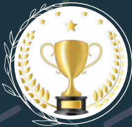
MARYUM MAHMOOD 1 a^ & 2 b^