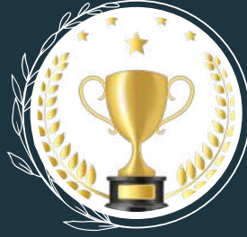
RAGHAD ALI ELHAM AL-KIYLI 3 a^